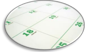
Date and Time